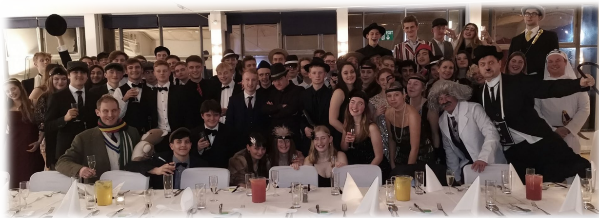
Sixth Form History Dinner, February 2020 (the food and costume of the 1920s)